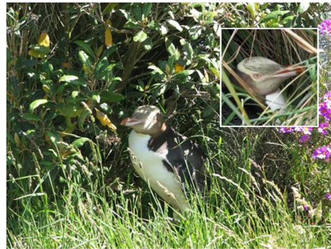
Yellow-eyed penguins nest in the bush

Unlike many other penguins, yellow-eyed penguins do not form breeding colonies.