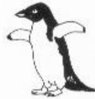
Adelie and Gentoo penguins